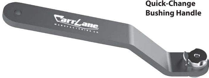
Quick-Change Bushing Handle

QUICK-CHANGE HANDLE: ALUMINUM WITH 1144 STEEL UN-A-LOK LINER PERMANENT HANDLE: MILD STEEL