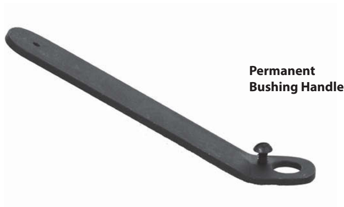
Permanent Bushing Handle