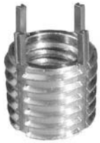
Heavy Duty – Stainless Steel

BODY: 303 STAINLESS STEEL. KEYS: 302 STAINLESS STEEL