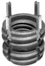
Heavy Duty – Stainless Steel Internal-Thread Locking

Stainless steel version of our general-purpose threaded inserts with a thick, heavy-duty thread wall. Key Inserts are ideal for thread reinforcement, especially when the mating stud or bolt will be removed frequently. These stainless inserts provide strong, permanent stainless steel threads in any parent material, ferrous, non-ferrous, or non-metallic. Key Inserts are also well suited for quick repair of stripped, damaged, or worn threads. Locking keys positively prevent the insert from rotating.