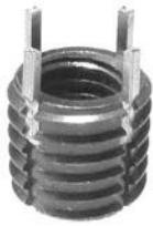
Heavy Duty – Steel

BODY: 1215 STEEL, BLACK OXIDE FINISH OR DRY LUBE. KEYS: 302 STAINLESS STEEL