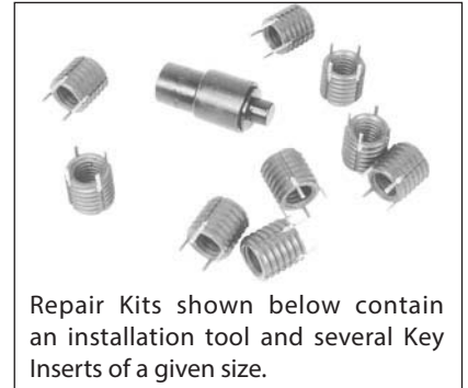
Repair Kits shown below contain an installation tool and several Key Inserts of a given size.