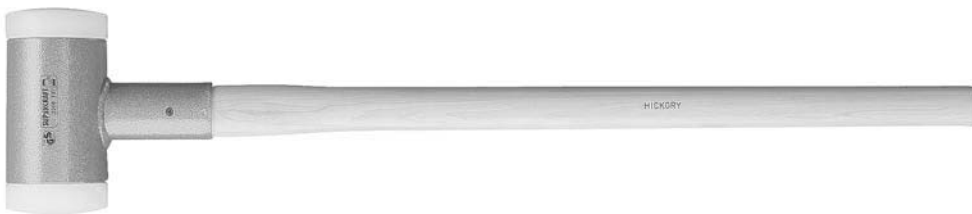
Supercraft Sledgehammers (Wooden Handle)