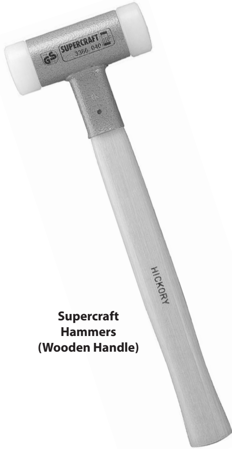
Supercraft Hammers (Wooden Handle)

HOUSINGS: STEEL ASSEMBLY CONTAINING STEEL PELLETS. HANDLE: HICKORY WOOD. INSERTS: NYLON, NATURAL WHITE COLOR, HARDNESS 68-78 SHORE D