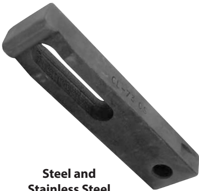
Steel and Stainless Steel

STEEL: 1018, CASE HARDENED, BLACK OXIDE FINISH STAINLESS STEEL: 300 SERIES