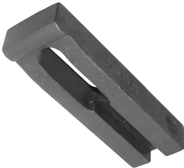
Steel and Stainless Steel

STEEL: 1018, CASE HARDENED, BLACK OXIDE FINISH STAINLESS STEEL: 300 SERIES