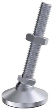
Steel Zinc Plated

STEEL: 1215, CASE HARDENED (BODY ONLY), ZINC PLATED YELLOW CHROMATE OR BLACK OXIDE FINISH STAINLESS STEEL: 300 SERIES. DELRIN® PAD: WHITE DELRIN® 500.