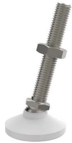
Stainless Steel with Delrin® Pad

High-quality, heavy-duty leveling foot with large-diameter pad and integral stud. Stud and ball are one solid piece. Large ball provides high load capacity with a 20° total swivel angle.