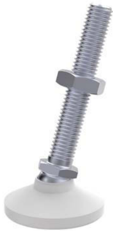
Steel Zinc Plated with Delrin® Pad