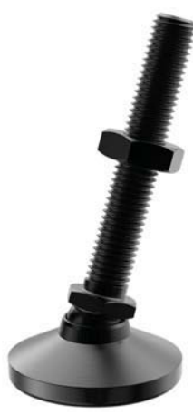
Steel Black Oxide Finish