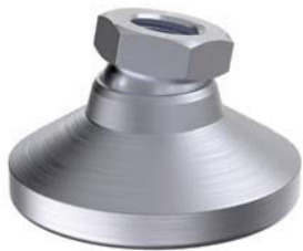
Steel Zinc Plated

STEEL: 1215, CASE HARDENED (BODY ONLY), ZINC PLATED YELLOW CHROMATE OR BLACK OXIDE FINISH STAINLESS STEEL: 300 SERIES. DELRIN® PAD: WHITE DELRIN® 500.