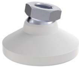
Steel Zinc Plated with Delrin® Pad