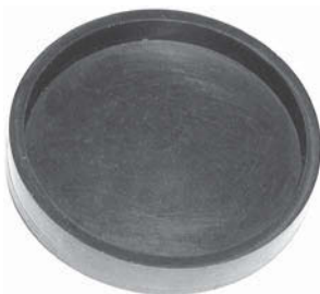
Rubber Pad Covers for Leveling Feet

*Safe static load with stud securely mounted in a plate at least one-stud-diameter thick, at maximum stud extension (2:1 safety factor). Leveling Feet are rated with the same-length stud as on Stud Leveling Feet. Load capacity will drop significantly with longer studs.