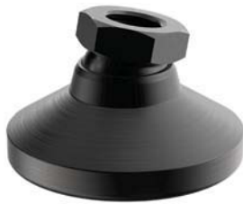
Steel Black Oxide Finish