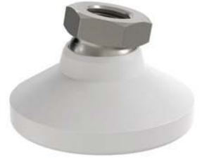
Stainless Steel with Delrin® Pad

High-quality, heavy-duty leveling foot with large-diameter pad. Large ball provides high load capacity with a 20° total swivel angle.