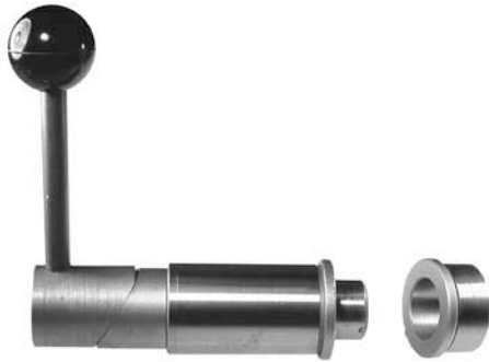
Straight Index Plungers Rotary Cam Standard Mount

PLUNGER, BODY, CAM, AND BUSHING: 1144 STEEL, HEAT TREATED. CENTER SHAFT: 1144 STEEL. SPRING: MUSIC WIRE. BALL KNOB: BLACK PHENOLIC PLASTIC WITH MOLDED-IN BRASS INSERT