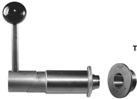
Tapered Index Plungers Rotary Cam Flange Mount

PLUNGER, BODY, RETAINER, AND CAM: 1144 STEEL, HEAT TREATED. CENTER SHAFT: 1144 STEEL. SPRING: MUSIC WIRE. BALL KNOB: BLACK PHENOLIC PLASTIC WITH MOLDED-IN BRASS INSERT