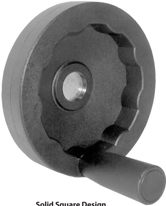
Solid Square Design Thermoplastic with Revolving Handle