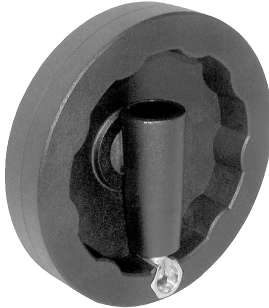
Solid Square Design Thermoplastic with Foldable Revolving Handle

High-quality, thermoplastic Hand Wheel with contemporary design. Molded-in steel hub. These Hand Wheels are bored to the standard shaft diameter for their size. Available with either a Revolving Handle, a Foldable Revolving Handle, or a plain rim without a handle. Matte black high-impact thermoplastic (textured surface for secure gripping, excellent impact resistance, operating temperatures to 230°F).