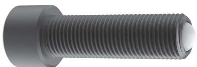
Rolling Ball (Delrin)