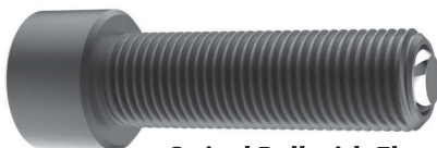
Swivel Ball with Flat (Stainless Steel)

The rolling-ball version shown above is available in thread sizes from 1/4-20 to 5/8-11 (M6 to M16 in metric), each in a choice of two lengths.