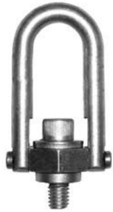
Optional Long-Ring Version

Long-ring version provides extra reach and allows using larger lifting hooks.